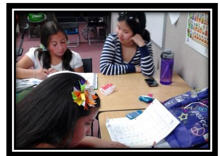
Hum....what might the answer be?