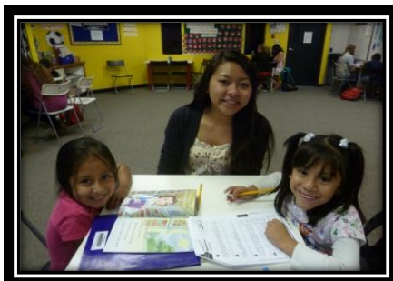
Still smiling as we do homework