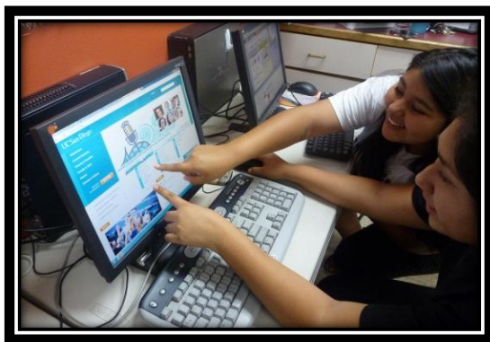
Look at this college!