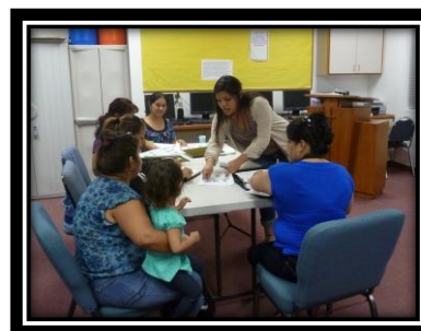
It is fun learning English with others