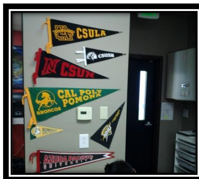
The schools we are attending