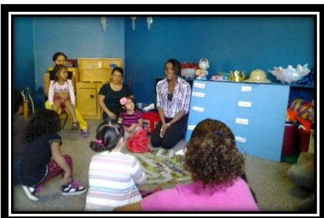
In my family there are four people