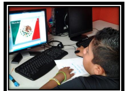
This PowerPoint will be great