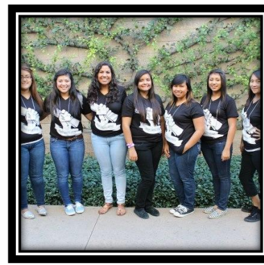
We look great on the APU campus tour!