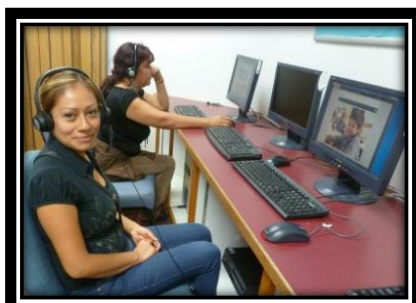
I am going at my own pace.