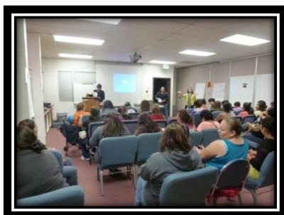
We want to know about internet safety