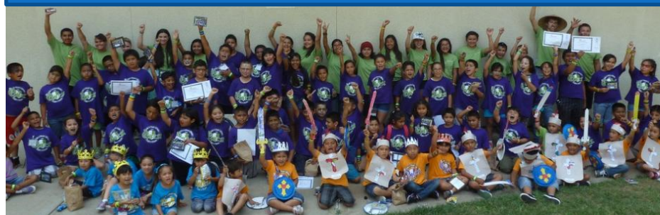
Summer fun at Glenkirk with all ages

Our clients are students and parents of whom 100% are of Hispanic origin with the majority of our parents self identifying as monolingual Spanish speakers. English language learners in the U.S. have doubled over in the last 10 years in the United States and in California Latinos are the fastest growing population, the largest immigrant population and the population with the largest number of high school drop outs.