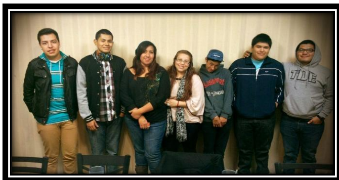
Reconnecting over pizza