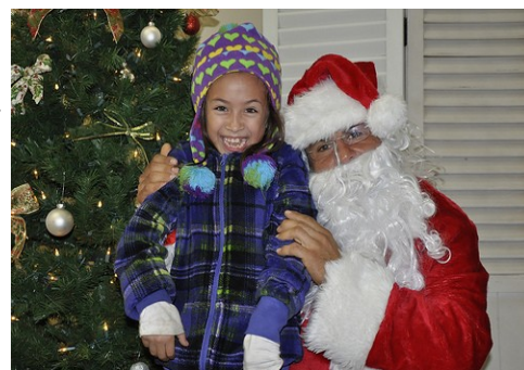
Santa granting wishes