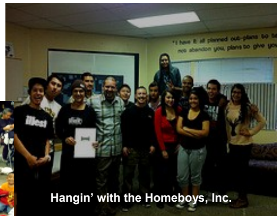
Hangin' with the Homeboys, Inc.