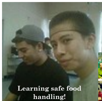
Learning safe food handling!

One such opportunity occurred in the students' visit to the Azusa Adult School . Students were surprised that they could take classes leading directly into the workforce right here in their own backyard!