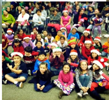
Time to Celebrate!