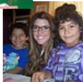
Love to learn!