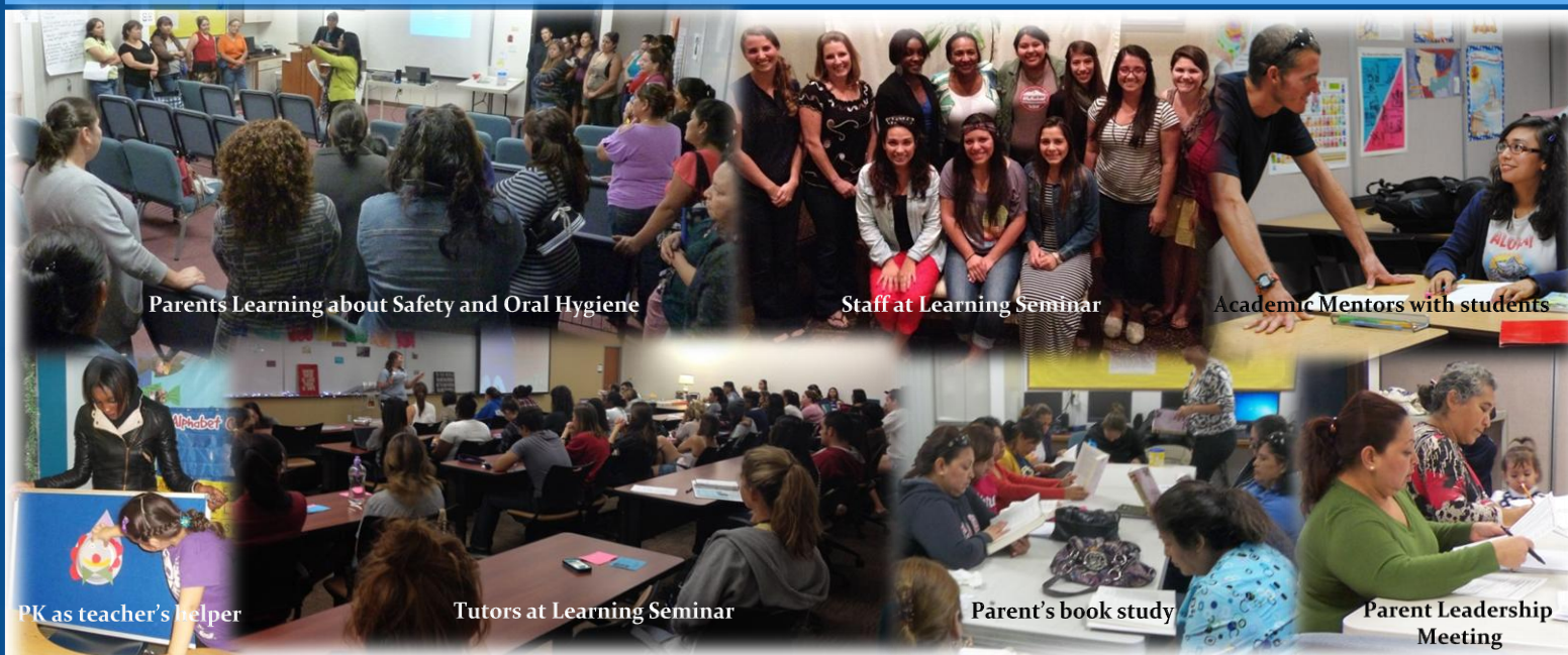
Parents Learning about Safety and Oral Hygiene